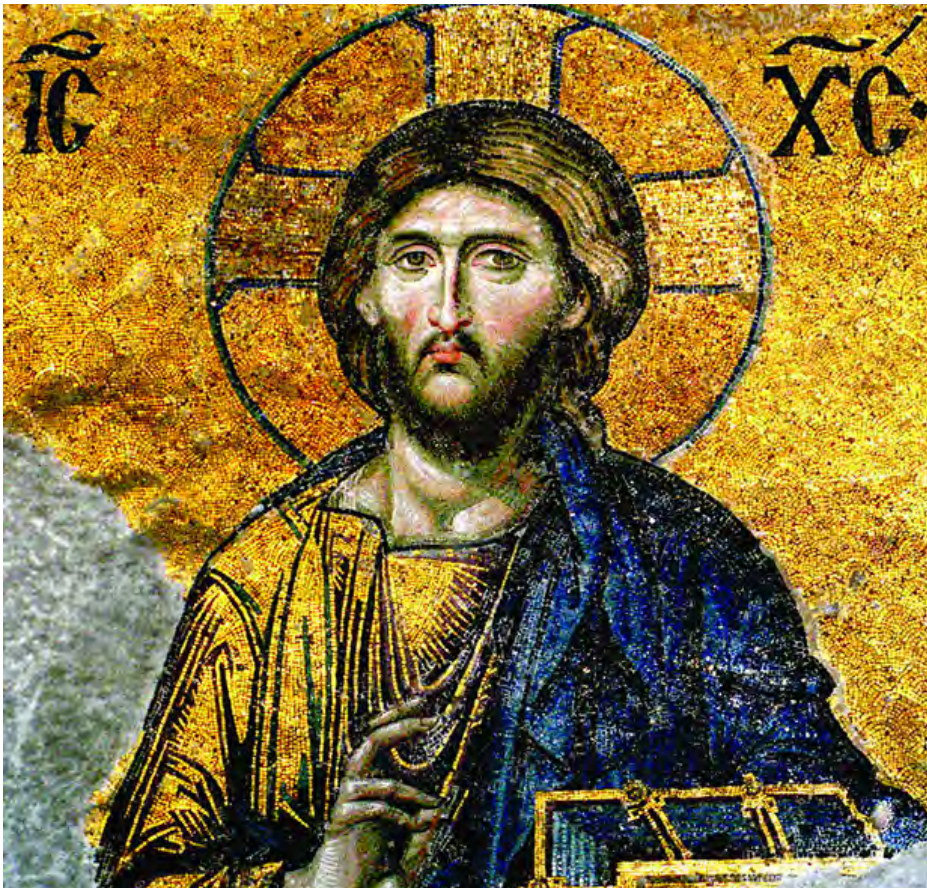
Image: Byzantinischer Mosaizist des 12. Jahrhunderts / Public domain